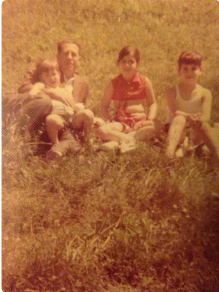
My dad, Sister and younger brother in Riverside park